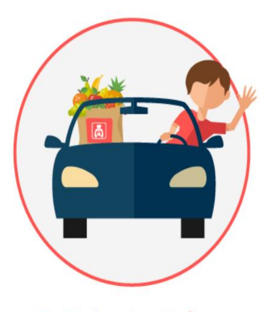
3. Drive to Deliver