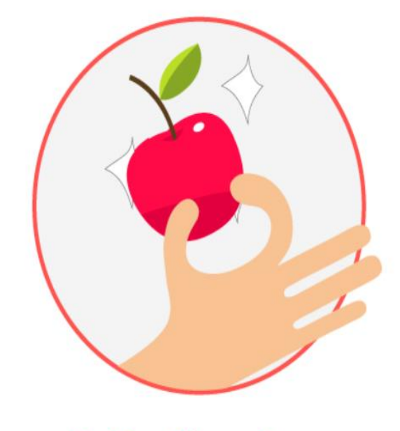
2. Go Shopping