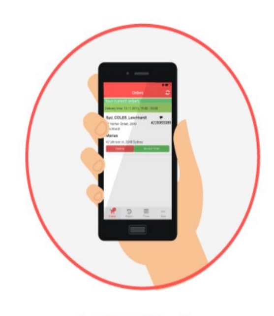
1. Get Orders